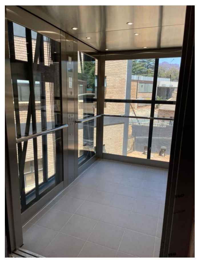
DOPPLER 2000 kg. panoramic retail lift Northcliff Corner

Jessen Lifts is accredited with the quality management system stamp,