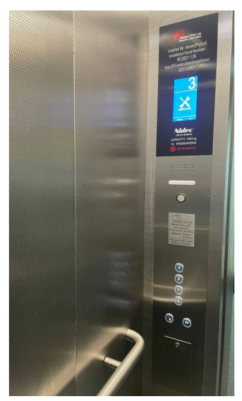
20 GOLDMAN STREET :