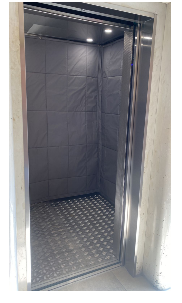
CBD RESIDENCY AJO BUILDING : NIDEC ELEVATORS